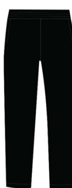
LEISURE PANT UNISEX FIT