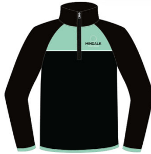
1/4 ZIP TOP