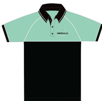
SHORT SLEEVE POLO