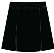
ELASTIC WAIST SKIRT