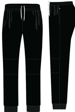
TRACKPANT DOUBLE KNEE