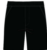
ELASTIC WAIST SHORT